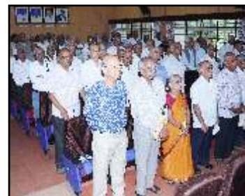
Guests & Pensioners taking "Swachh Bharat" Pledge