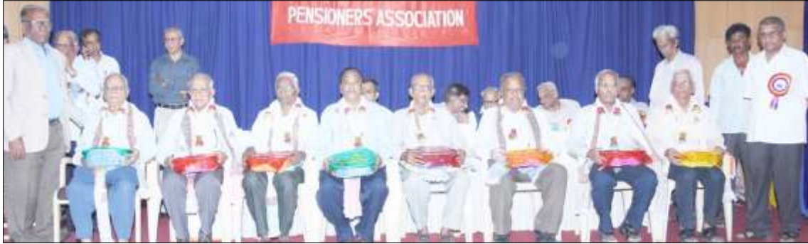
Felicitations to the Members of 75 years of age